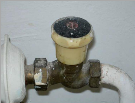
Drehregler ohne Thermostatventil

Heizkörper haben Thermostatventile? ja nein nicht anwendbar, keine wasserführenden Radiatoren